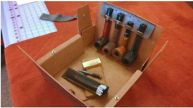
Bag in full open (box) configuration. Note that the Pipe securing leather strip allows for 4-7 pipes/pipe bags depending upon size and width of pipes (with or without bags). 4 loose Pipes shown.