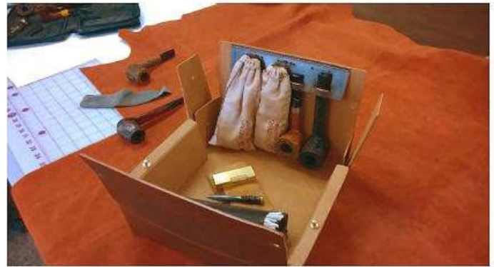
Bag in full open (box) configuration. Note that the Pipe securing leather strip allows for 4-7 pipes/pipe bags depending upon size and width of pipes (with or without bags). 2 loose Pipes and 2 in bags shown.