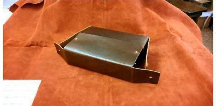
Process to open and configure. Step 2—Open bottom side flaps