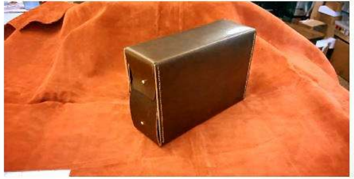
Closed configuration—Back of Bag