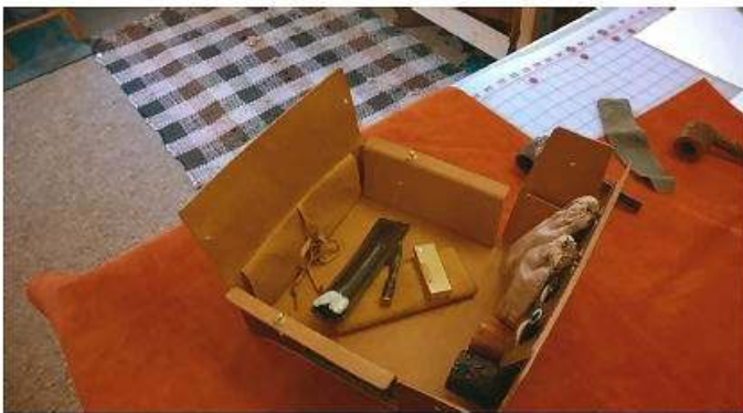
Down angle shot of loaded bag in box configuration

Additional Notes: I used as few studs as required in order to make it easier to open/close and configure. I can carry a pipe cleaner sleeve, 2 tampers and my Dunhill lighter in the pouch sewn into the top inside of the bag. I can also carry 2 pipe tobacco pouches (fairly full) and various tinned tobaccos inside of the bag when closed (I place them in a pouch to protect the loose pipes finish).