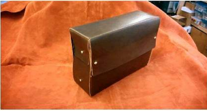
Closed configuration—Front of Bag