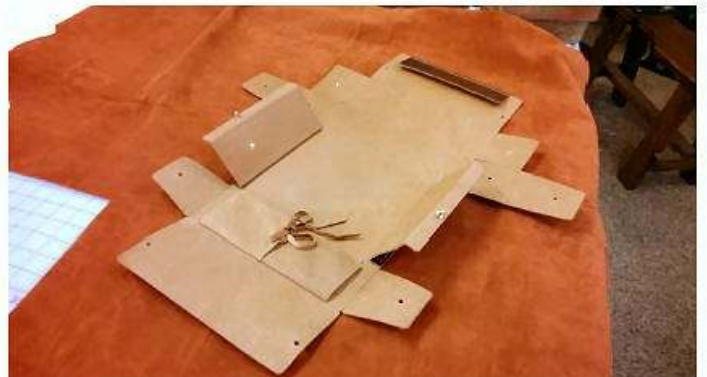
Process to open and configure. Step 6—To open bag completely for flat storage unsnap long side flaps from supporting flap studs in back and lay flat.