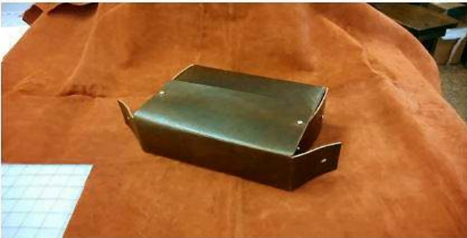
Process to open and configure. Step 1—Open top side flaps