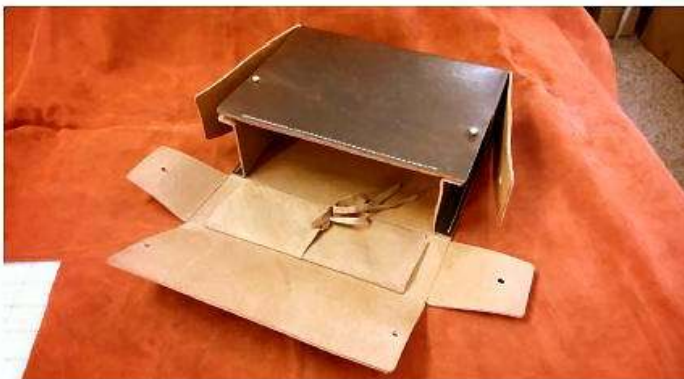
Process to open and configure. Step 3—Open top flap by pulling top off of side studs and folding back (Access to internal pouch now available).