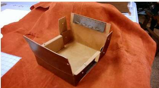
Process to open and configure. Step 5— Fold top of bag (holding accessory pouch) forward and snap sides onto studs (thereby making a box)